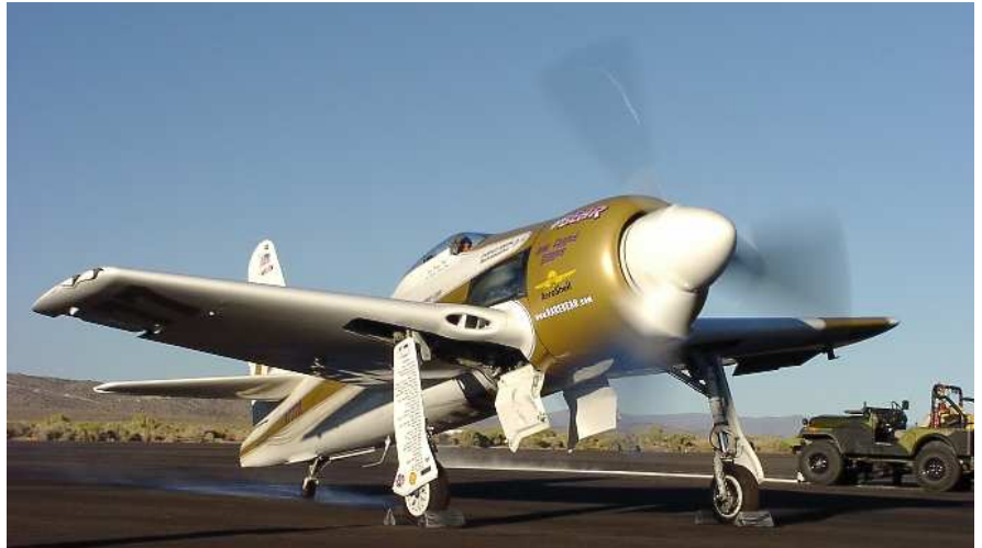
Right: Rare Bear at a run-up on the apron in the evening