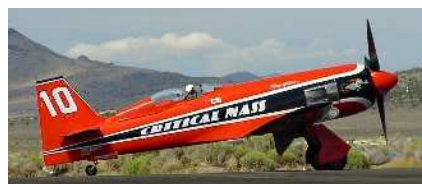
Tom Dwelle in his Critical Mass

races are divided in a way that almost every plane is in the air once per day. Therefore the 6 to 8 planes, which fit each other best in performance, fly in the same race. Highlights are the final runs in each class, the actual gold-, silver- and bronze races.